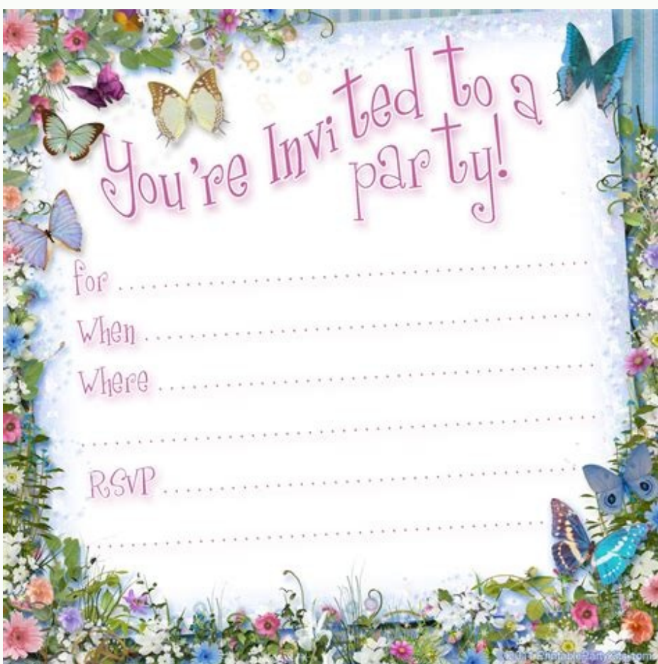
95th birthday invitation ideas. 1st birthday invitation ideas for a girl. Birthday invitation example. Birthday invitation price.